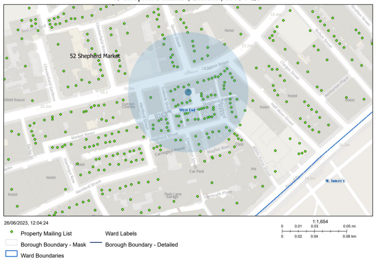
46 Shepherd Market, London, W1J 7QS